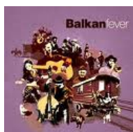
Balkan Fever (Wagram)