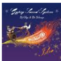
Iskra (Gypsy Sound System)